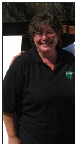
Preparations: NxGen Preserve garden